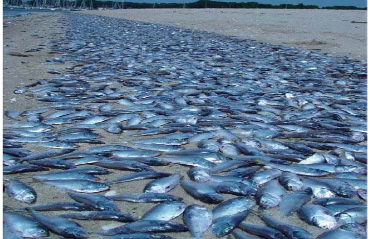
Figure 3: Excess levels of N in coastal waterways may cause nutrient overenrichment leading to lack of oxygen and fish kills.

For surface ammonium-N water quality standards , EPA is re-evaluating the current water quality criteria to determine if they should be revised to reflect new toxicity data. For more information see the EPA website at: http://www.epa.gov/waterscience/standards/ammonia/ .